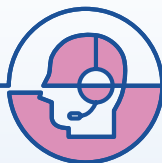
Pharmacovigilance & Risk Management