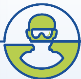
Clinical Development Strategy

With vast international business and clinical research experience, DZS' President brings in-depth strategic planning, personnel management and subsidiary oversight to our seasoned leadership team and in bridging our global organization. Leading multiple M&A activities in Japan, his contributions have led to the expansion of the CRO business for the WDB Group as a whole most notably perhaps in the US and EU. Both tireless and resolute, his leadership is marked by an appreciation for innovation, an ambition towards constant improvement, and a demonstrated vision in adding value to both members and clients alike.