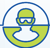
Clinical Development Strategy

Support your product development with our worldwide presence including U.S., EU, MENA, and APAC region and a wide range of global capabilities.