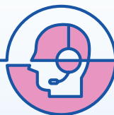
Pharmacovigilance & Risk Management